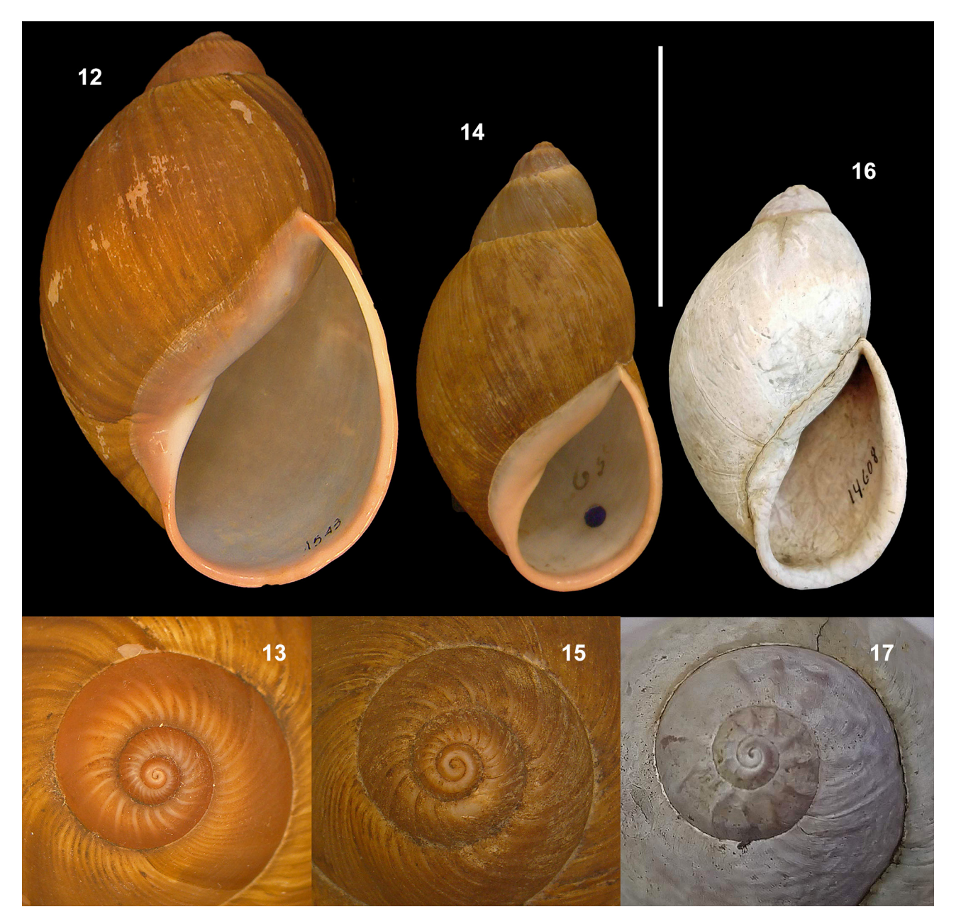
Figs 12–17. Shells of Megalobulimus spp. for comparison, with detail of protoconch: 12–13 – M. bronni , specimen MZSP 92421, from Além Paraíba (MG), ventral view (12) and protoconch detail (13); 14–15 – M. yporanganus , holotype MZSP 64144, from Iporanga (SP), ventral view (14) and protoconch detail (15); 16–17 – M. klappenbachi , holotype MZSP 29317, from Iguape (SP), ventral view (16) and protoconch detail (17). Scale bar for shells 50 mm

the shells could have been brought passively (usually post-mortem) into the cave by water, such as during flooding events (e.g., VIEIRA & SIMONE 1990). Those two options indicate, respectively, an autochthonous or parautochthonous (the shells are reasonably well preserved) origin of the snails. However, Lagoa Santa is also an archaeological setting, which brings the human factor into the fold.